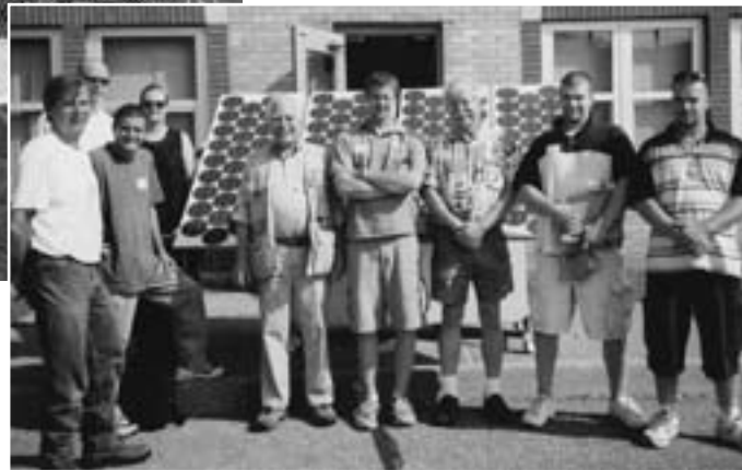
A solar installers' class at Ulster BOCES.