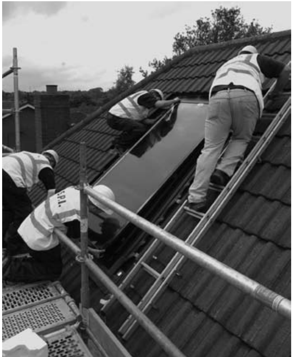
A team of professional solar installers

It is well documented that jobs in solar